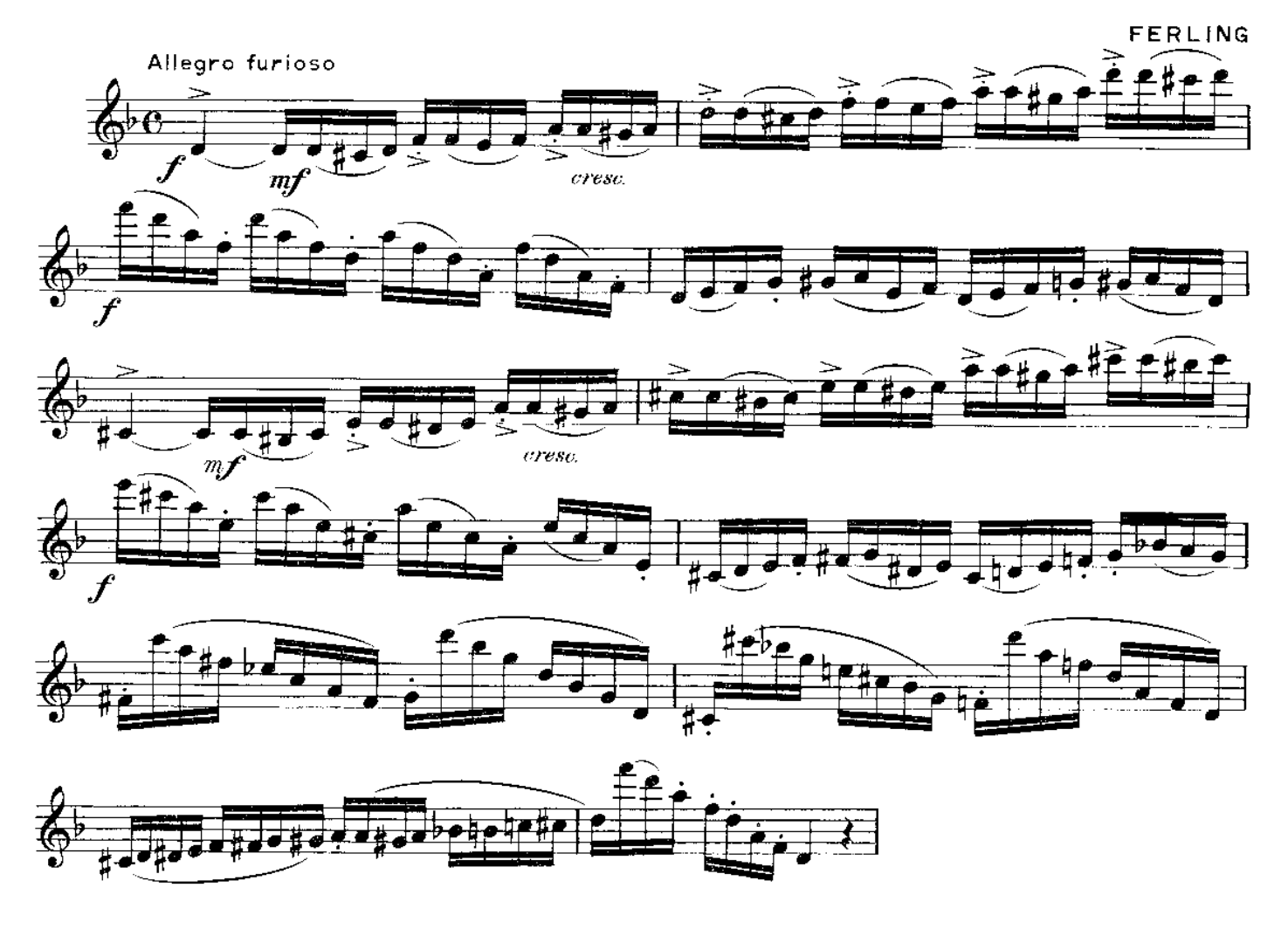
Copyright MCMXLII by Rubank, Inc., Chicago, Ill. Copyright Renewed International Copyright Secured Used by Permission

Excerpts of etudes reproduced with permission from Hal Leonard Corporation. Rubank Educational Library publications available at music stores nationwide or through Music Dispatch (1-800-637-2852); www.musicdispatch.com.